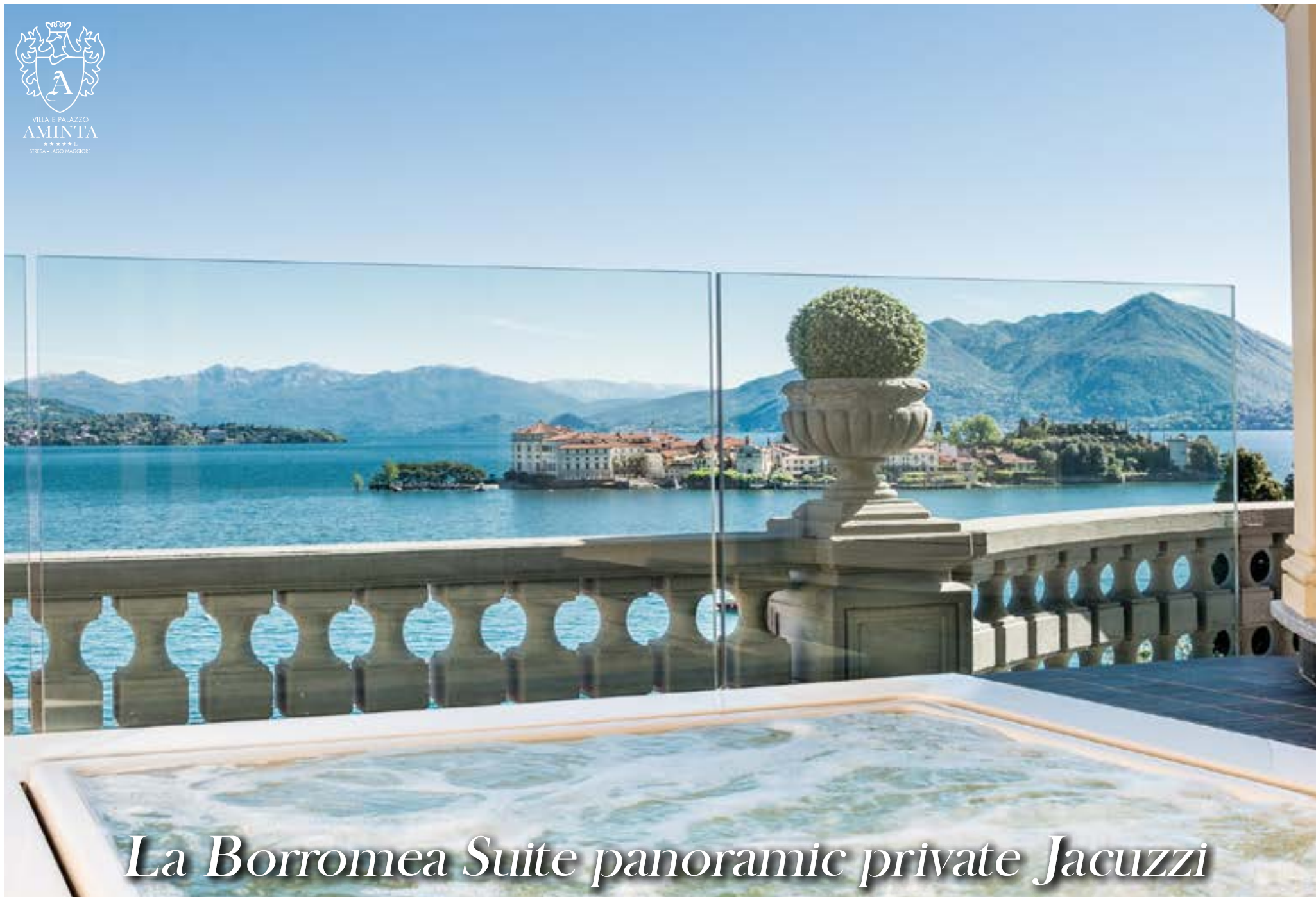
La Borromea Suite panoramic private Jacuzzi