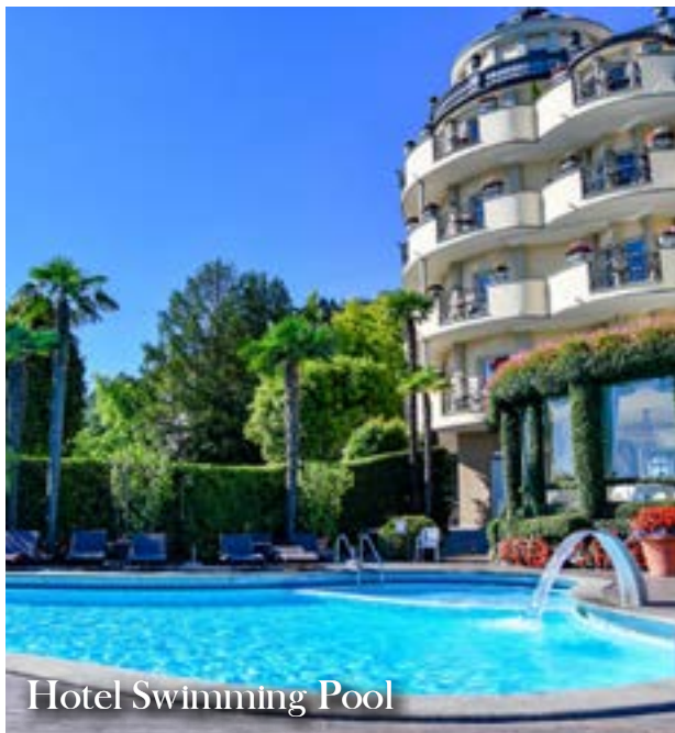
Hotel Swimming Pool