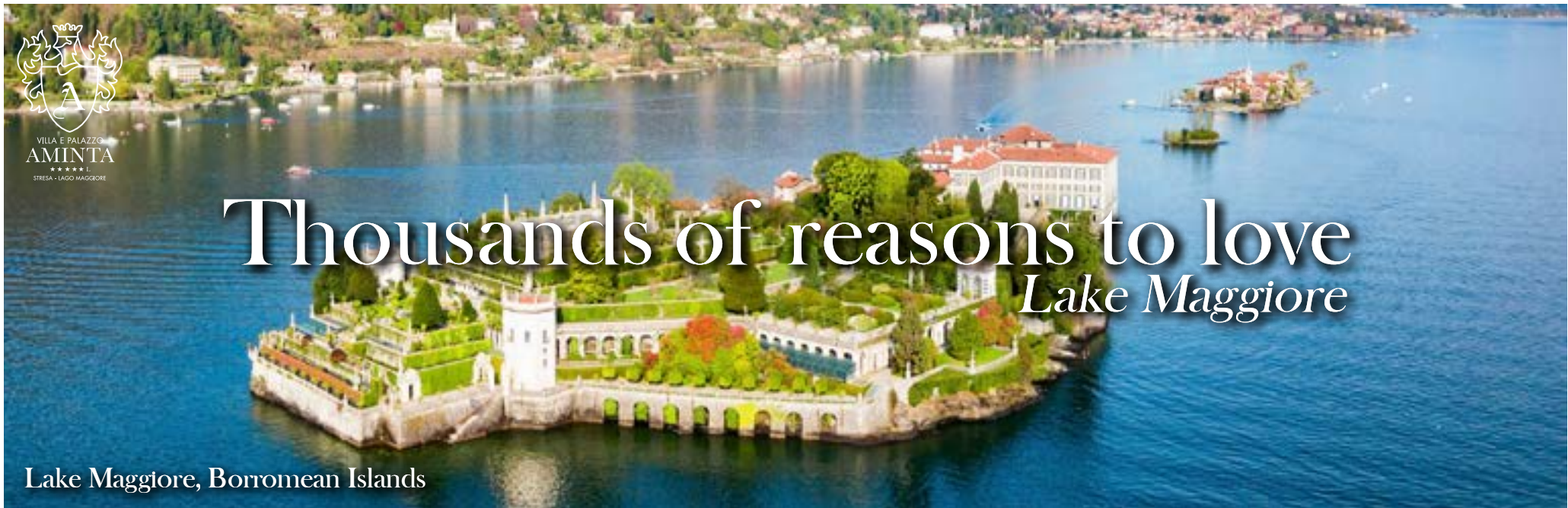
Lake Maggiore, Borromean Islands