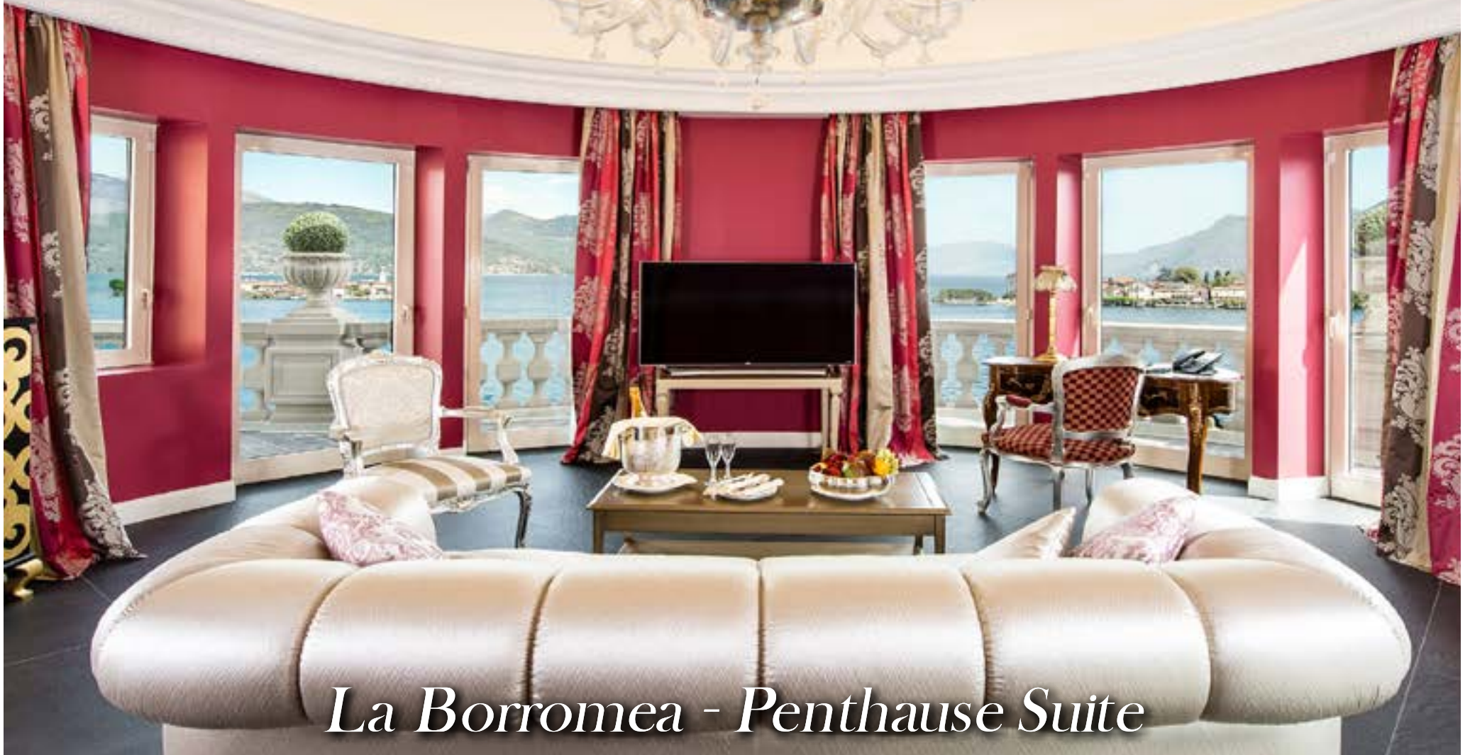
La Borromea - Penthouse Suite